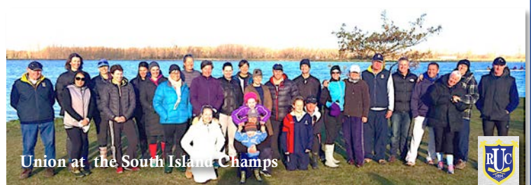
Union at the South Island Champs