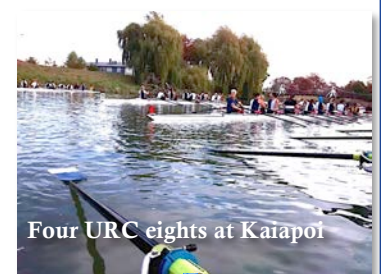
Four URC eights at Kaiapoi